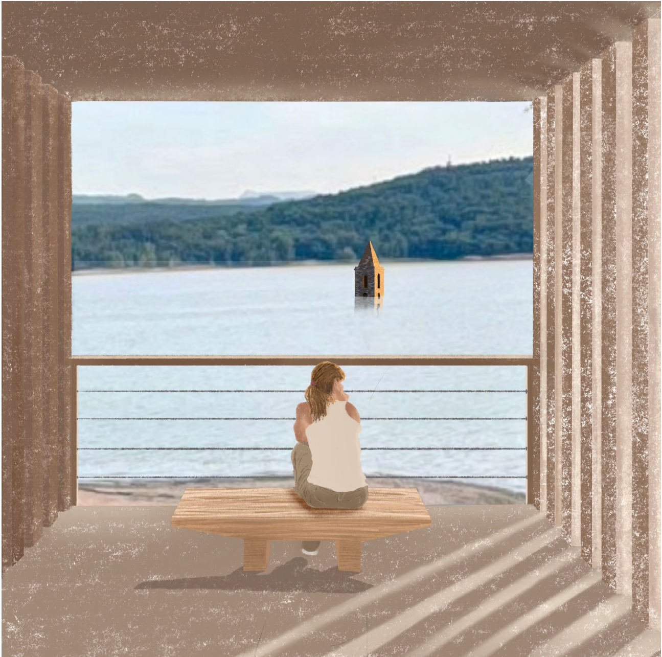
The meditation area is intimate and focuses on light effects and landscape frames.