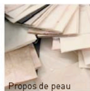
Propos de peau