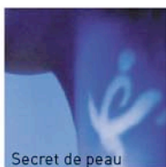
Secret de peau

Their projects all glorify the poetics of the five senses, swaying from sensuality to artistic expression and put into question the limits of tactile seduction. Hence they nurture the new light Nivea wants to shed on skin.