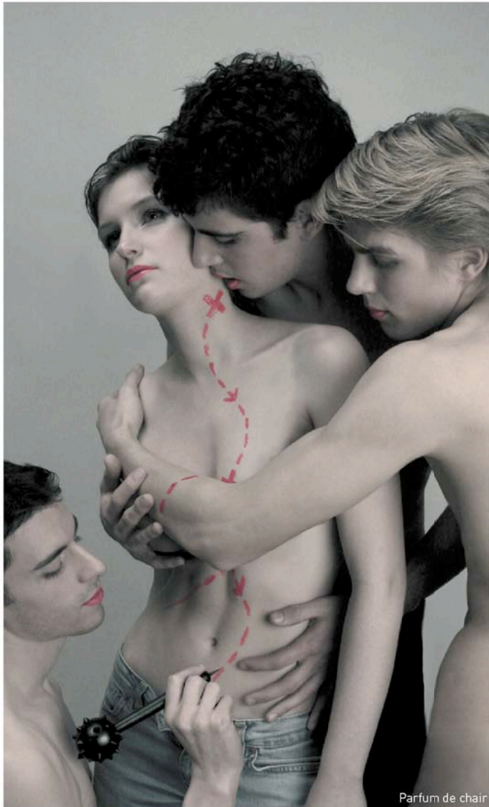
Parfum de chair

MINISTÈRE DE L'ÉDUCATION NATIONALE Olivier de Serres École Nationale Supérieure des Arts Appliqués et des Métiers d'Art 65, rue Olivier de Serres F 75015 Paris Tél. : 33 (0) 1 53 68 16 90 Fax : 33 (0) 1 53 68 16 99 www.ensaama.net