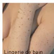
Lingerie de bain