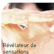
Révéléateur de sensations