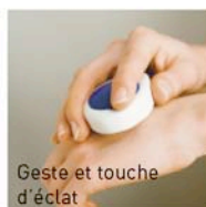
Geste et touche d'éclat