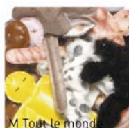
M Tout le monde