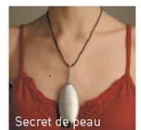
Secret de peau