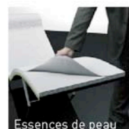
Essences de peau