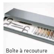
Boîte à recoudre